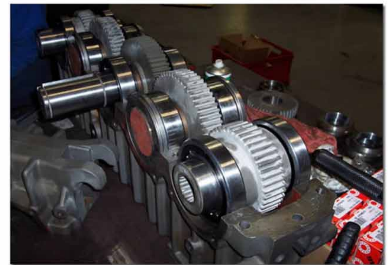
Crane Gearbox Refurbishment