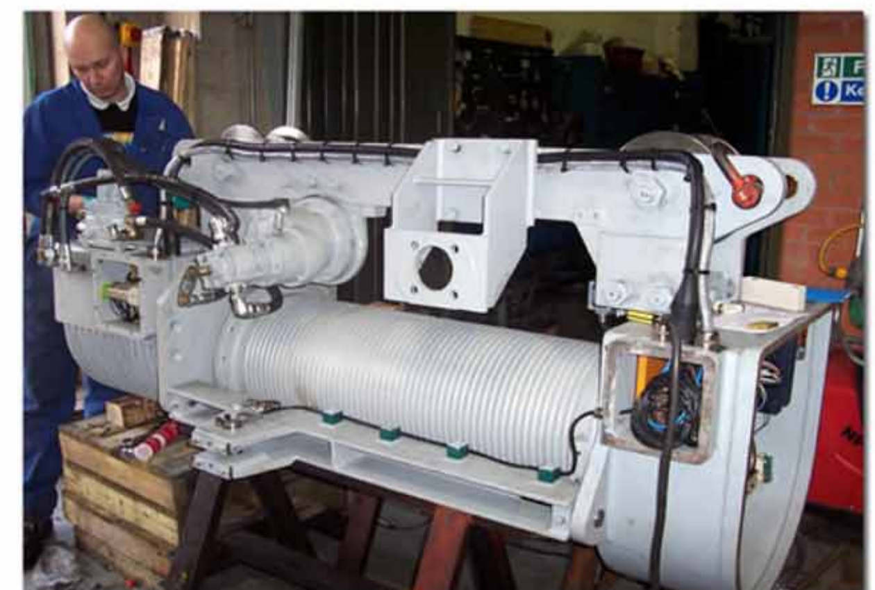
Gantry Crane Refurbishment

Trust Alatas for all your crane requirements!