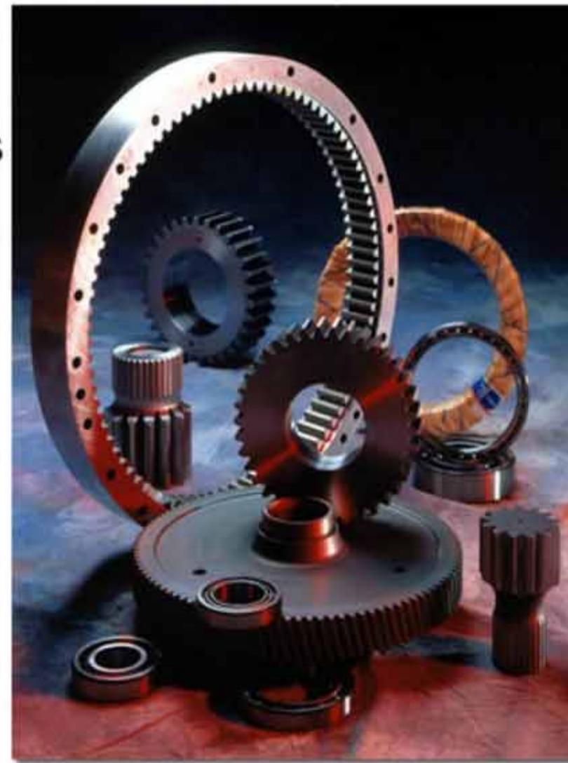
Winch & Gearbox Parts

Cylinder repairs. Hydraulic pump and motor repairs. Hydraulic pumps and motor sales. Specialist part manufacturing.